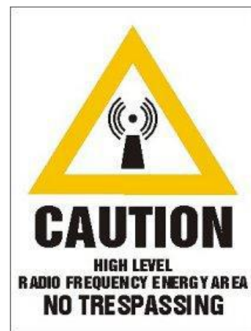
Figure 1: RF-EMF Warning